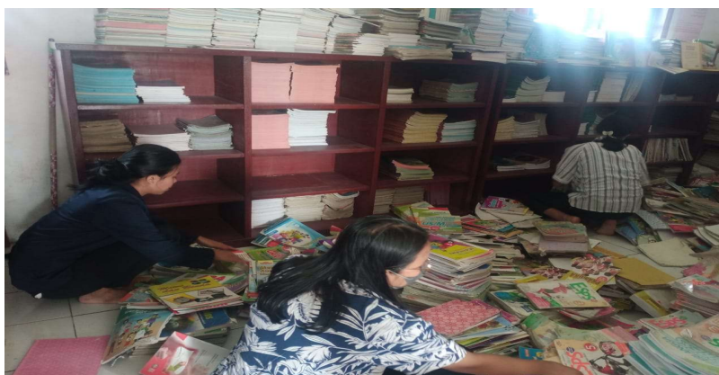
Figure 3 Library Archive Repair Process

This activity was carried out to help repair the library at SD Negeri 091409 Sarimatondang, which was abandoned and not maintained. The school welcomed this activity by trusting the PKM Team to improve the library. In this section, the PKM Team selects books that are suitable for use and those that are obsolete. Then arrange the books based on each category to make it easier for students to find the book they want to read. Apart from that, to make it easier for the school to see the number of books in the library, the PKM team also recorded and reported the number of books still suitable for school use. So that through this activity, students will be more enthusiastic about coming to the library to improve literacy and numeracy in English.