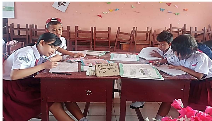
Figure 2. Implementation of Additional Teaching Hours

The activity of adding study hours is necessary because there are still some students who still need to meet the learning achievement criteria. It can be seen from the results obtained in the Pre-test. For students who are not fluent in English literacy and numeracy, it won't be easy to continue learning activities because they cannot understand the lessons given at the beginning. To overcome this problem, the PKM Team opened additional study hours outside of school hours for all students who experienced this problem.