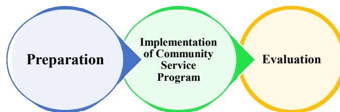
Diagram 1. Implementation Method

According to Anas Zulkifli (2013), the method is a way that can be done to implement plans that have been prepared in the form of natural and practical activities to achieve a goal. The Community Service Program (PKM) at SD Negeri 091409 will be held from 6 – 25 February 2023. This activity targets all students at SD Negeri 091409 Sarimatondang and involves all students implementing Community Service and field supervisors. In carrying out this activity, there were several stages carried out by the PKM Team of SD Negeri 091409 Sarimatondang, which can be seen in the following diagram: