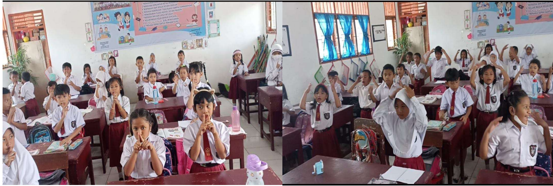
Figure 1. Literacy and Numeracy Activities Through “English Day”

numeracy, namely the “English Day” program. In practice, the PKM implementation team will teach literacy and numeracy using simple English so students can easily understand without boring them. In addition, learning activities will be accompanied by other activities, such as singing while studying in English. It is important for motivating and uplifting students.