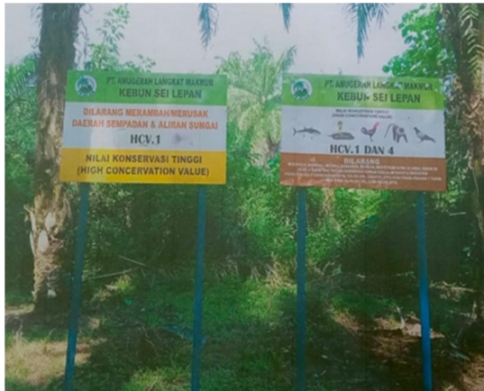
Figure 2. Signs Forbidden to Destroy Plants and Kill Animals at Sei Lengan Garden Locations

The program has a primary focus on behavioral change and the intensity of its outcomes. In order to change public behavior, its activities can be related to several things such as improving the health sector, ecology, transportation, and in non-profit organizations.