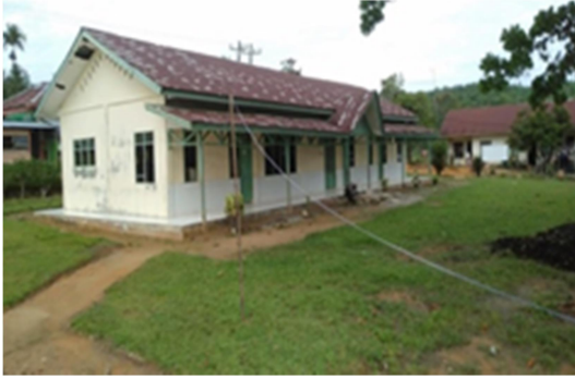
Figure 4. CSR in the Religious Sector (Construction of a Pastor's House in Sei Lengan District)