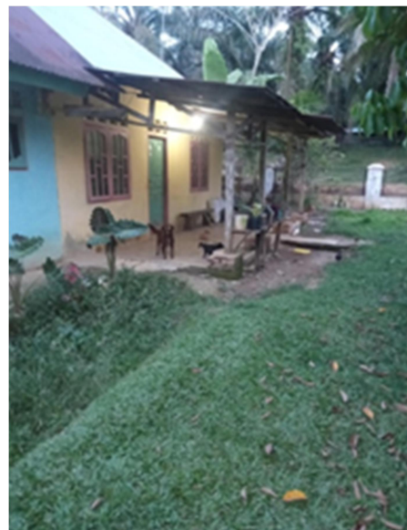
Figure 3. CSR in the Religious Sector (Construction of a Mosque in Sei Lengan District, Langkat Regency)

Activities that have been carried out by PT ALAM in executing this program, for example, is giving monthly donations for mosques and churches, mosque nadzir during Eid, donations of money for iftar at mosques, donations for gravediggers, and assistance for local teachers' fees.