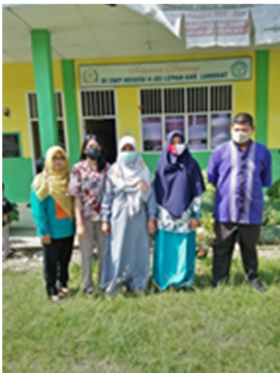
Figure 6. CSR in Education Sector (Construction of Junior High School Buildings in Sei Lengan Subdistrict and donated to Langkat Regency Government to Become SMPN 4 Sei Lengan)