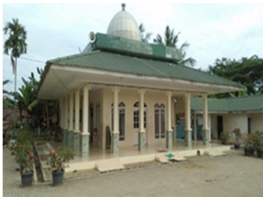
Figure 5. CSR in Education Sector (Construction of Madrasah Schools in Sei Lengan Subdistrict)